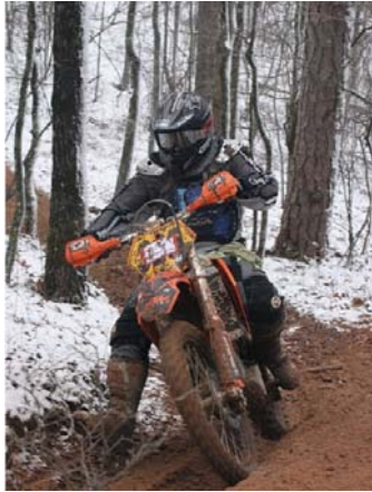
IT WAS A COLD ADULT ENDURO BUT THE SNOW DIDN'T STOP ANYONE FROM RACING!